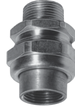
1/2" – 4"