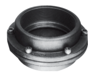
5" – 6"