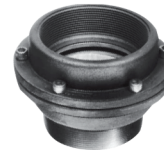
5" – 6"